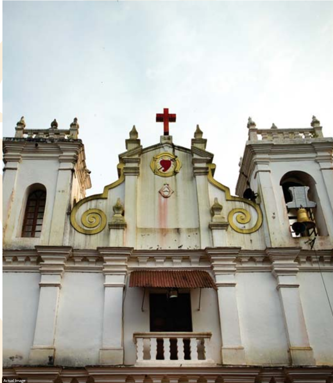
Church of Bom Jesu, Nachinola, 1676.