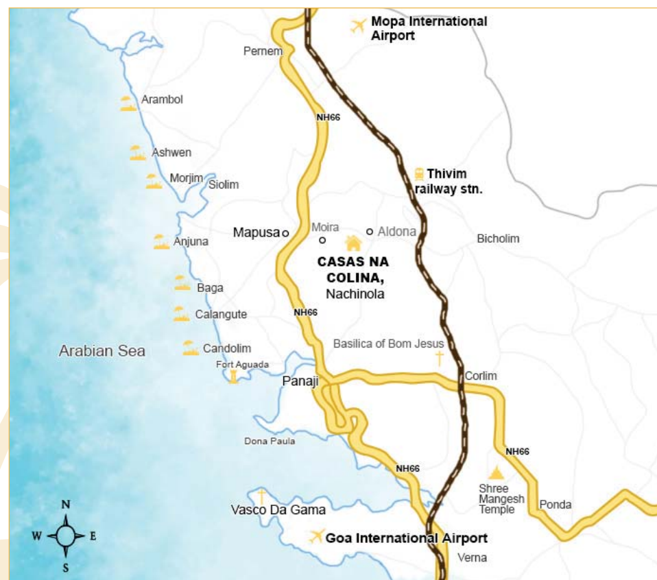
Map not to scale.